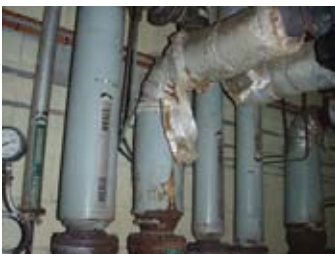
Deteriorated insulation allows heat loss so repair promptly.

Insulation of boiler and steam lines and condensate return piping and fittings reduce heat loss by as much as 90 per cent, as shown in Table 3. Surfaces over 50°C should be insulated.