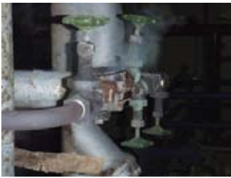
Repair steam leaks promptly to reduce energy loss.

Steam leaks should be rectified to prevent steam loss, which requires additional boiler feed, chemicals and fuel to heat the water.