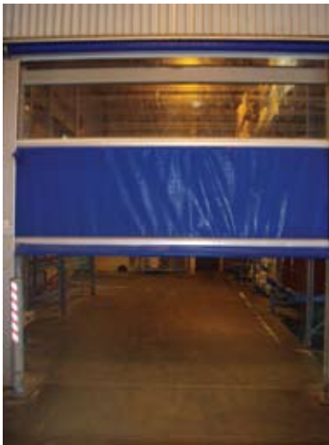
Self-closing doors and strip curtains can be used to minimise heat ingress to refrigerated areas.