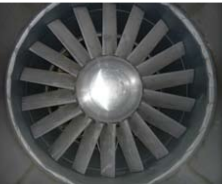
Operating fans only when required will reduce energy consumption.

The impeller can be trimmed if a pump is continuously throttled to 10 per cent less than its design flow rate or the bypass valves are continually open, indicating excess flow. Trimming involves machining the impeller to reduce its diameter, which reduces the amount of energy it imparts to the pumped fluid.