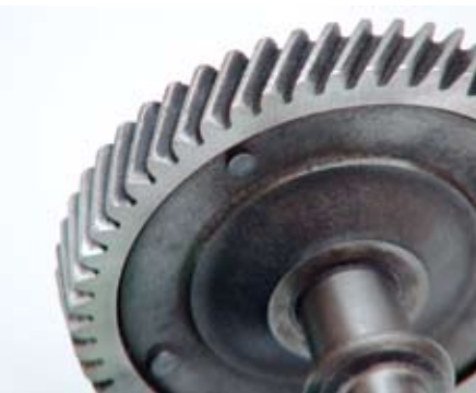
Well-maintained motors will increase efficiency.

Friction losses can be reduced by reducing the number of bends and valves in pipework. It is also important to ensure the diameter of the pipework is not too small, thereby creating additional load on the pump, motor and fans. In some cases the type of material used in pipework can also reduce friction losses.