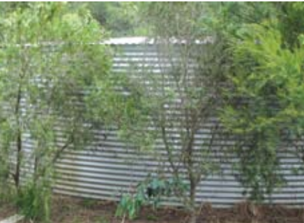
Stormwater can provide an alternative water source for activities such as cooling tower and boiler makeup water.

Depending on the level of contamination and use, pre-treatment of stormwater may be required for some applications. As the security of supply is dependant on rainfall, processors will need to ensure they have an adequate catchment and storage capability or back-up mains supply to meet the demands of the intended use.